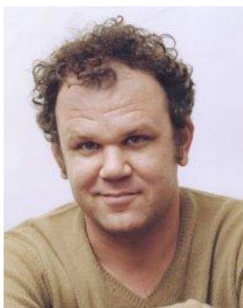
JOHN C. REILLY